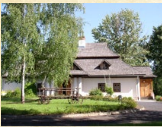
Manor house from Krzeszowic, beasted in Inn "Pastewnik"