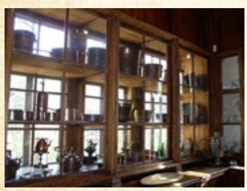
Museum in Przeworsk - interior of the palace - the kitchen.

On the first floor of the museum, there are mementoes presenting rich, centuries-old history and material and spiritual culture of Przeworsk and its surroundings. One of the more interesting exhibits are the documents issued for Przeworsk by Polish kings and