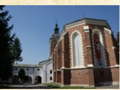
The Order of the Holy Sepulcher church and monastery.

There is the baroque pillar chappel raised at the peak of the mound. (about. 40 min.) Return to the old square – along the Tatarska street and next Kiliński street, where in turn are preserved 19th-century Houses, built using city defensive wall. From the old square – toward