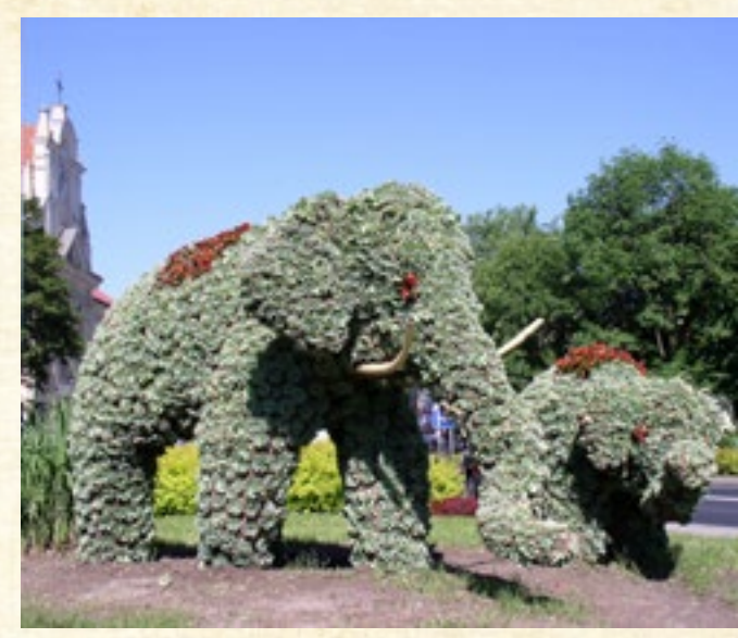
The elephants, Fot. K. Ignas

The sculpture of the leaf (design with steel rods filled with earth). It has form of two elephants and is standing on the national road No. 4. Is a popular subject, where the residents and newcomers make memorable photos. It aas created about 1975 together with the whole team of flower sculptures: a globe, a vase, an eagle – Polish coat of arms located in different places on the territory of Przeworsk. For now preserved only elephants, the symbol of peace and happiness by associating themselves positively with Przeworsk.