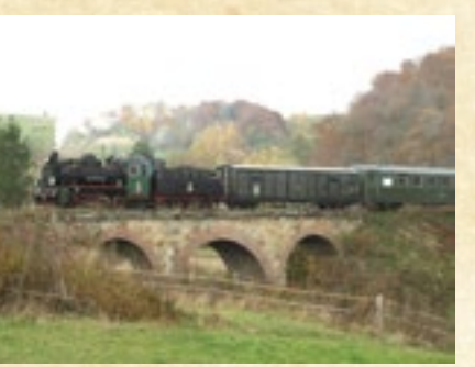
Narrow-gauge railway.

At the beginning of the visit it is worthile to go on a tour of the narrow-gauge railway – journey on the route Przeworsk-Dynow, stop at the station in Bachorz, the way back from Bachorz to Przeworsk. The railway is available during the summer season from May to September on weekends, as a tourist train "Pogorzanin". Departure at 9am from the station Narrow Przeworsk. The station of the Narrow-gauge rail-