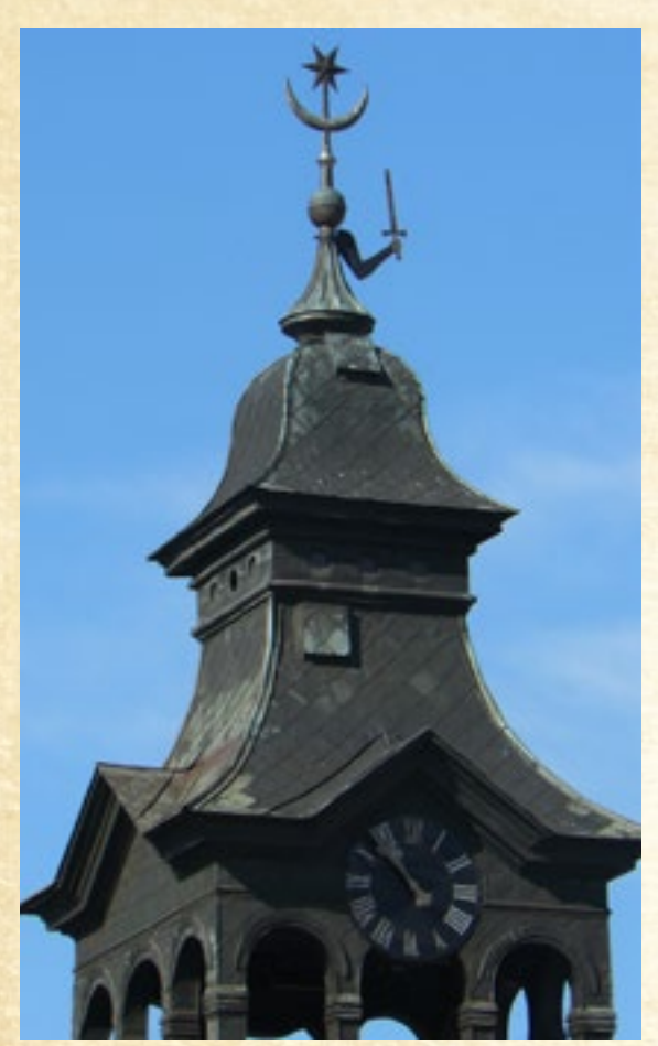
Town Hall Tower - topping – Leliwa emblem and symbol of the right to punish death

ity in the Subcarpathian Voivodeship, in the administrative district Przeworsk, on Rzeszow foothills, situated above Mleczka, distant from border crossing with Ukraine in Medyce about 60 kilometers. In the years 1975-1998 the town administratively belonged to the province of Przemysl. The city has about16 thousand inhabitants. The name of city is united with the old Polish word "przewora", meaning barrier. First mention of the village dates from the year 1281. In 1393 Przeworsk - John from Tarnow coat of arms Leliwa property - got from king Vladyslav Jagiełły municipal rights.