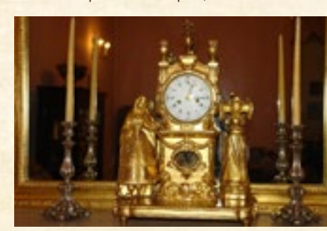
The interior of the palace - fireplace clock.

the stable buildings is located museum of Fire Prevention - old horse -drawn extinguisher, collection of parade and battle helmets, battle equipment, firefighter's uniforms. decorations. derived from equipments of the voluntary fire brigades from Podkarpacie region. Walk and break in the historical park with