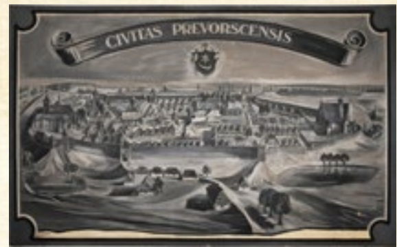
Civitas Prevorscensis (painting of H. Drozda). Fot. H. Górecki, from collections of Museum in

At the end of the 15th century the town was surrounded with earth embankments and a church and Order of the Holy Sepulcher monastery were included into town's defense system. Another church and Friars Minor of the Observance monastery built in the east end of the town also deterred enemies and gave shelter to townspeople during attacks. The town hall was located in the center of the town's market square and there were 13 narrow streets within the embankments in 1512. The town had four suburbs: Łańcuckie, Jarosławskie, Pruchnickie i Kańczudzkie. Przeworsk in the 15th and 16th century was the second, after Przemyśl, county town in Przemyśl district.