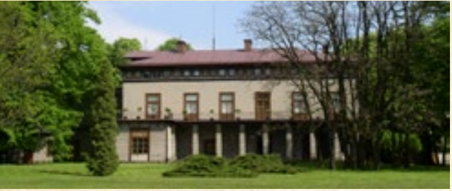
Lubomirski Family Palace.

The entrance leading to Lubomirski landscape park and residence was located by the old Hungarian route (now European route E-40). The gate consisted of four pillars with stone vases on the tops of them. The front of the pillars was decorated with the owners' emblems, which were destroyed by Red Army soldiers in July 1944. There was a guardhouse behind the gate, built about 1923 in style similar to the palace architecture. A wooden building was located there before the First World War, but it was destroyed during the war.