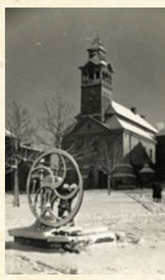
Well on the market, in the background town hall. Fot. A. Łączkowski, 1943 r. - from collections of Museum in Przeworsk

A deep well with a beautiful cover, Przeworsk water supply, was the pride of Przeworsk market square. The well was most probably built by Marcin Borelowski, a metalsmith and a well digger, known as one of the leaders of the January Uprising. The market square was lit by about 20 large, glass, kerosene street lamps.