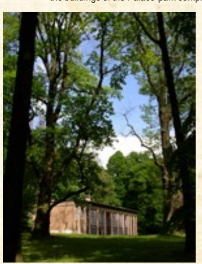
Orangery in the park.

and battle helmets, battle equipment, signalling devices, fire uniform, decorations, dating from equipping Volunteer Fire services from the area of Podkarpacie. Walk around and rest in the historic park, with the buildings of the Palace-park complex (Conservatory, guardhouse,