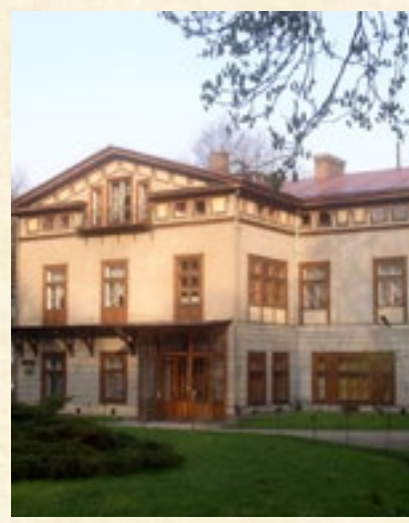
The Museum in Przeworsk.

is an essential point of the stay, active in weekends between 10am - 2pm. Park and Lubomirski Palace, where the Museum is located in Przeworsk. the western part of the city, next to the "Pastewnik," by the bridge across Mleczka. In the building of the Palace of the Lubomirski family are presented historical and ethnographic collections and Exposition of the classical Palace Interior. While in the depths of the park buildings after stables. the Museum of the Firefighting is being housed - - collection of horse hosepipes, collection of parade