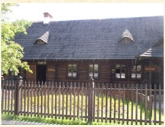
Open-air museum and inn "Pastewnik".

its palace and park complex buildings (orangery, kordegarda, garden house), monumental trees, grave alley, the King Sobieski linden, public gardens, horse-chestnuts, wejmut pines. (around 3 h.) From the park to the west, through the bridge on Mleczka River – to the Open-air museum – tavern "Pastewnik", where is possible to see wooden middle-class architecture, houses took as residences by craftsmen and mercahnts from Przeworsk and also smal manor house from Krzeszowice from year 1701 – perfect example of the "polish court" architecture. In the "Pastewnik" tavern, there is served traditional polish cousine lunch, drink coffee or regional beer. (around 2,5h.) Visit in the "Pastewnik" Tavern is the last point of the 1-day visit in Przeworsk