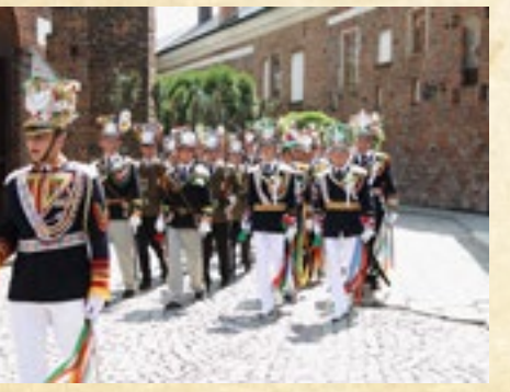
The courtyard of the parish church, parade Turks.

in the mass at 3pm (approx. 40 min.) Walking from the Basilica, then by the market, to the Church and Bernardine monastery, where a few