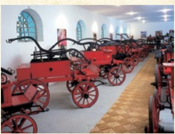
Firefighters Museum - fire - pump exhibition, Fot. G. Sznaj

In the old stables, the history (from the second half of the 19th century until nowadays) of Przeworsk and nearby fire departments is presented. The fire department collection is diverse and consists of horse drawn fire hoses, parade and field helmets, field equipment, signalizing devices, uniforms and fire department distinctions. Some are also some photographs included in the collection, we have here firefighters from Przeworsk and its surroundings, fire stations, firefighter orchestras and firefighter competitions. What is more, in wooden coachhouse, there is an exhibition of carriages from the end of the 19th and the beginning of the 20th century. The collection is borrowed from the palace in Łańcut, and consists of: a carriage with the Lubomirscy's emblem, a landau, a milord-type carriage, town carriage and Rzeszów britzka.