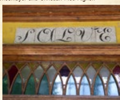
Salve - inscription over the entrance to Lubomirski Family Palace., Fot. K. Ignas

In 1850s, the palace was rebuilt by Feliks Księżarski. On the second floor, there was a drawing room in the form of veranda made of wood and glass, pulled down about 1918. From the eastern side, the seat of Lubomirski family had a row of decorative roofs, wooden balconies with cast-iron brackets and balustrades. The interior decor was designed by Aigner and his two partners, Fryde-