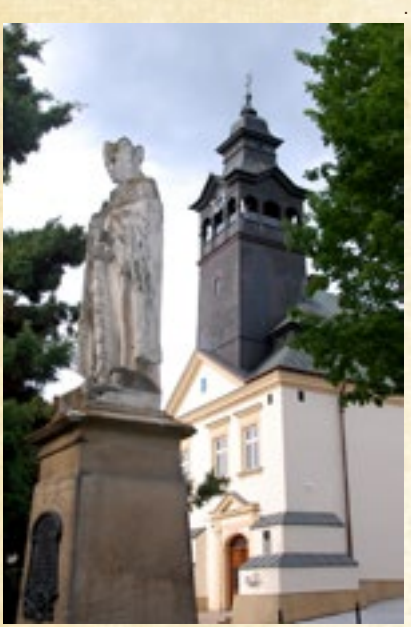
Town hall and the monument of king Wladislaw Jagielly.

The town hall and market square were surrounded by tenements. North of the town hall, there was a synagogue (not existing nowadays) and Kazimierzowska street, inhabited by Jews. Behind the town hall, in the so called small market square, there is a yard where the first Przeworsk church and the first seat of the Order of Holy Sepulcher, St. Catherine's used to be located. It was demolished in the 18th century and was no longer a part of the town's skyline.