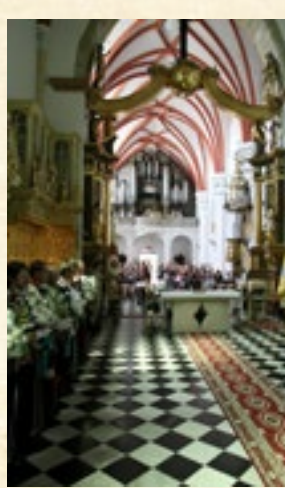
Interior of the Order of the Holy Sepulcher church and monastery, Holy Mass during the parade Turks.

The inside of the church was exceptional. The high altar, called the Great Altar, with a figure of crucified Christ, embellished with figural and plant motives, was made in 1693 and funded by the then provost Franciszek Chodowicz to celebrate the 300th anniversary of the parish. Inside the church we can find also a bronze font from 1400, the epitaph painting of the founder of the church, Rafał Tarnowski with his family from about 1492 and 15th century tombs of Rafał Tarnowski and Anna of Szamotuly, 17th century choir stalls with glassed balcony for Lubomirski family over them, lavishly carved pulpit with figures of saints from 1713 and baroque side altars and organ gallery. Moreover, there are 18th century paintings by Observant painter Franciszek Lekszycki in the church.