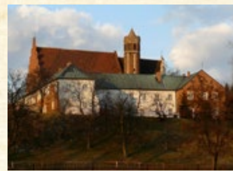
Friars Minor of the Observance church and monastery.

At the beginning of the 17th century, the walls were built by an engineer Krzysztof Mieroszewski (who also took part in fortifying Krakow and Częstochowa). 'The Przeworsk monastery seemed to be a necessary fortress and a shelter for local people' and its defensive role was highlighted by the