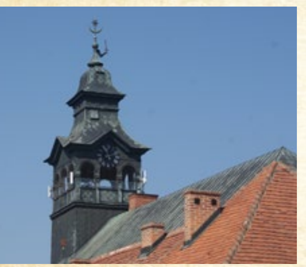
Town Hall Tower.

The town hall was the seat of town authorities and the town's showpiece, with the only clock tower in the region, crowned with the symbol of the right to practise capital punishment – a hand with a sword. Through centuries, the town hall was changing its appearance and shape. It is located in the eastern part of the market square on the highest spot in the town. It was mentioned in the 15th century – the document, made by the owner Rafał Tarnowski in 1473, states the the town hall already existed in that time. It was most probably built by Wacław Klepacz, the court builder. The town hall was thoroughly rebulit two centuries later. It was a one-storey building, with a wooden tower. In the 18th century it was renovated, windows were changed, bars and stoves were repaired, and the inside was whitewashed. In 1868, according to town's books, it was a two-storey, worn out building, with seven room: a kitchen, a pantry, a cashier's office, two jail rooms, two shops, two cellars and stables. Until the end of the 19th century the first floor of the town hall was used as an inn. It was also a place where a measure and a balance were kept. The first floor was used as municipal council and court office. The court sentenced people to capital punishment until the ond of the 18th century and the