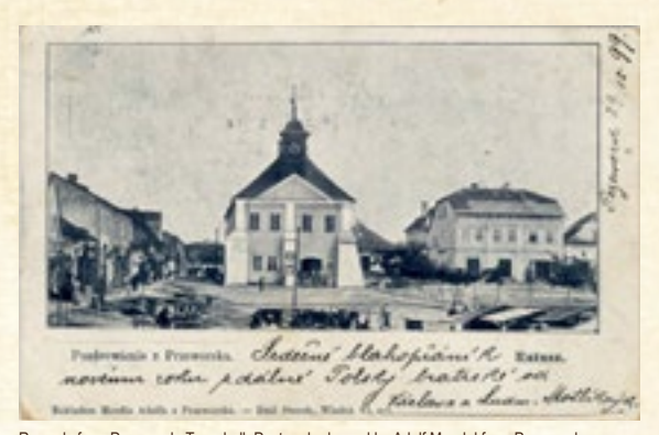
Regards from Przeworsk. Town hall. Postcard released by Adolf Mendel from Przeworsk, Wiedeń, 1899 r. from collections of Museum in Przeworsk.

During the Second World War the occupant did not spare Przeworsk monuments. First, the Nazis burnt the synagogue and Jewish houses in Kazimierzowska street and the rabbi's house with the library. The old courthouse was burnt and demolished. 16th century town walls were also demolished, and the bells from churches' towers were taken. The palace of the Lubomirscy was robbed of its valuables – the Nazis took 38 boxes of artistic silverware, world class works of art and national mementoes. The occupation government decided to remove the monument of king Władysław Jagiełło and it was knocked off its pedestal. Fortunately, the sculpture was not destroyed and the former town council members hid it in town stables, where it stayed until the end of the war, to be put back in its place.